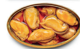
BOX OF DELIGHTS Rockfish's tinned British seafood gift set is exquisitely packaged and includes sardines, cuttlefish, mussels and mackerel. Almost too beautiful to open. £23.95 for 4 x 115-125g tins, therockfish.co.uk