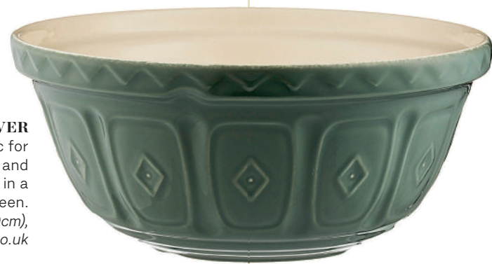
BOWLED OVER A practical classic for home bakers and pud makers in a beautiful sage green. £31.50 (29cm), masoncash.co.uk