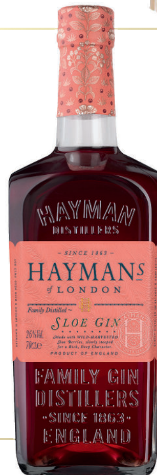
WARMING TOT Although pretty, some sloe gins can be overly syrupy. This one by Hayman's is sweet-sharp with a fruity complexity – wonderful over ice or mixed with sparkling wine. £27 for 70cl; or gift-wrapped for £29, haymansgin.com