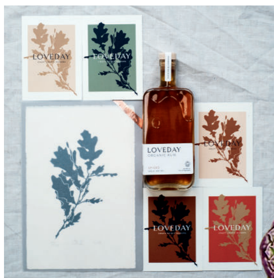
PACKS A PUNCH A wow gift for a spirits aficionado: a 50cl bottle of organic rum from artisan Cornish distillery Loveday, made from distilled slow-fermented molasses, then aged in oak for at least two years. Choose either gold or spiced rum in a date-stamped presentation box, which comes with an original oak-leaf lino print and set of cocktail recipe cards. £64, lovedaydistilling.com